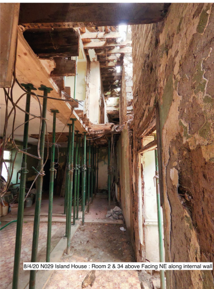
8/4/20 N029 Island House : Room 2 & 34 above Facing NE along internal wall