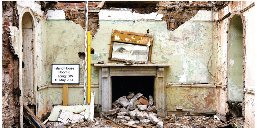
Island House Room 6 Facing SW 15 May 2020

Before any work could commence a survey of the building had to be completed, this involved photographs being taken and documentation generated by our team of experts to conform with legislative directives, the building is subject to surveys being conducted on a regular basis which are kept in a central repository.