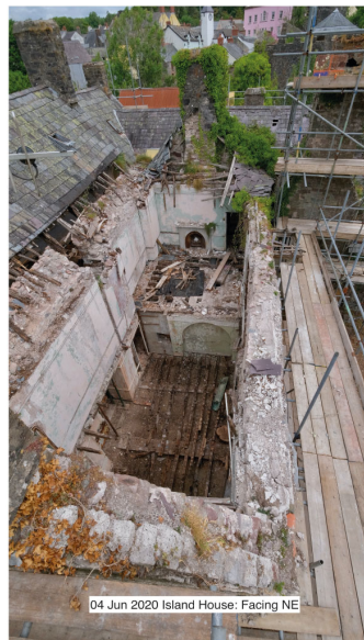
04 Jun 2020 Island House: Facing NE