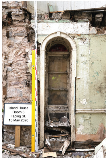
Island House Room 6 Facing SE 15 May 2020