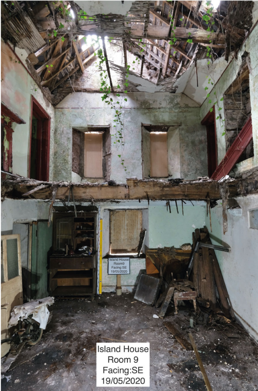
Island House Room 9 Facing SE 19/05/2020