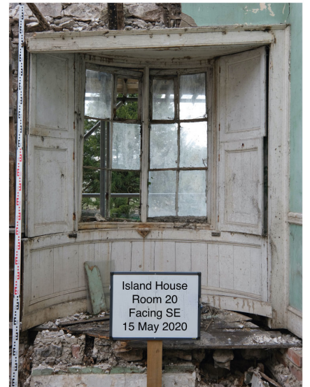
Island House Room 20 Facing SE 15 May 2020